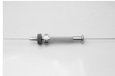
Buxton Ikuta Wire Driver, hand held driver for wires .028 through .062