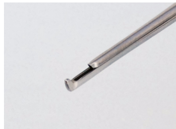
Small-Handle Punch, 250x1mm, 40° up-angled