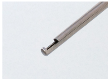
Small-Handle Punch, 250x2mm, 40° up-angled