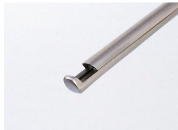
Ferris-Smith Punch, 180x5mm, 40° up-angled