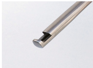
Ferris-Smith Punch, 180x6mm, 40° up-angled