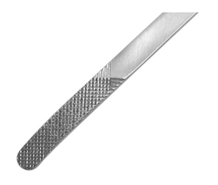
24-6141 Darrach Retractor, 260x19mm, serrated