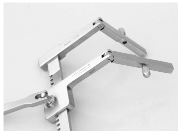
French Model Laminectomy Retractor, hinged arm, Frame only