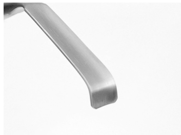
Cloward Blade Retractor, 18mm