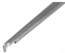
Small-Handle Punch, 180x1mm, 90° down-angled