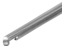
Small-Handle Punch, 200x3mm, 90° down-angled